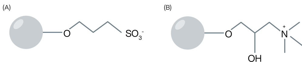
Figure 1. Structure of the ligand used in WorkBeads 100S (A) and WorkBeads 100Q (B).

Ion exchange chromatography (IEX) can be used for the purification of biomolecules, such as proteins, peptides and oligonucleotides, by utilizing the difference in their surface charge. The biomolecules interact with the immobilized ion exchange groups on the chromatography resin with opposite charge. WorkBeads 100S is a strong cation exchanger and will bind positively charged substances. WorkBeads 100Q is a strong anion exchanger and will bind negatively charged substances. The strength of the binding will depend on the number of charges involved in the interaction, and the distribution of the charges on the surface of the biomolecule. Charges on the biomolecule that is same as on the resin may reduce the interaction by repulsion. The structures of the ligands in WorkBeads 100S and WorkBeads 100Q are shown in Figure 1.