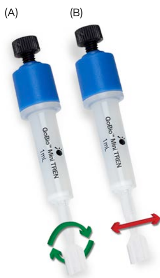
Figure 2. Removal of the cut-off end at the column outlet should be done by cutting or by twisting (A) not bending (B).

Connect the column to your equipment using the recommended connectors shown in Table 1. Fill the equipment with deionized water or buffer and make drop-to-drop connection with the column to avoid getting air into the column. Carry out all steps, except for sample application, at 1 mL/min (GoBio Mini 1 mL column) or 5 mL/min (GoBio Mini 5 mL column).