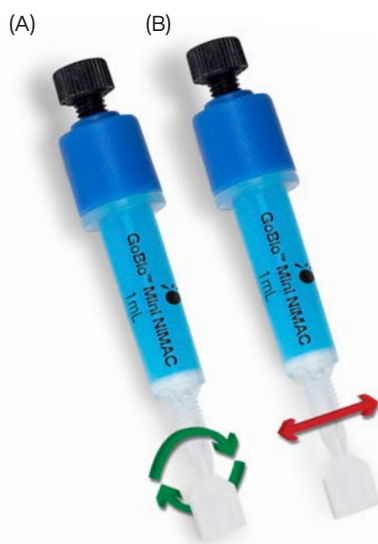
Figure 1. Removal of the cut-off end at the column outlet should be done by cutting or by twisting (A), not bending (B).

Connect the column to your equipment using the recommended connectors shown in Table 1. Fill the equipment with deionized water and make drop-to-drop connection with the column to avoid introducing air into the column. Carry out all steps, except for sample application, at 1 mL/min (GoBio Mini 1 mL column) or 5 mL/min (GoBio Mini 5 mL column).