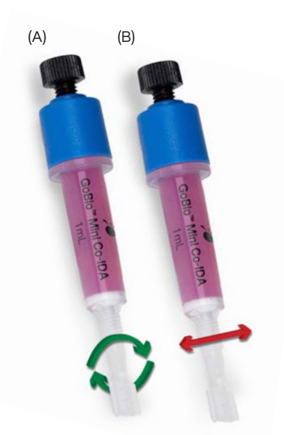
Figure 2. Removal of the cut-off end at the column outlet should be done by cutting or by twisting (A) not bending (B).

Connect the column to your equipment using the recommended connectors shown in Table 1. Fill the equipment with deionized water or buffer and make drop-to-drop connection with the column to avoid getting air into the column. Carry out all steps, except for sample application, at 1 mL/min (GoBio Mini 1 mL column) or 5 mL/min (GoBio Mini 5 mL column).